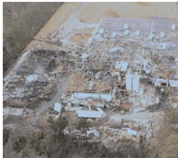
A pharmaceutical plant after a dust explosion.

An initial (primary) explosion in processing equipment or in an area where fugitive dust has accumulated may dislodge more accumulated dust into the air, or damage a containment system (such as a duct, vessel, or collector). As a result, if ignited, the additional dust dispersed into the air may cause one or more secondary explosions. These can be far more destructive than a primary explosion due to the increased quantity and concentration of dispersed combustible dust. Many deaths in past incidents, as well as other damage, have been caused by secondary explosions.